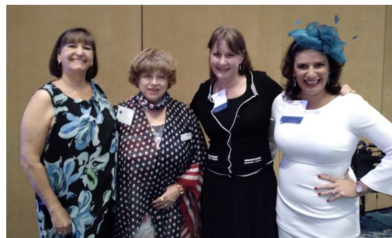
We had a wonderful night with honoring our members who are no longer with us, and enjoying time together with members from across the state